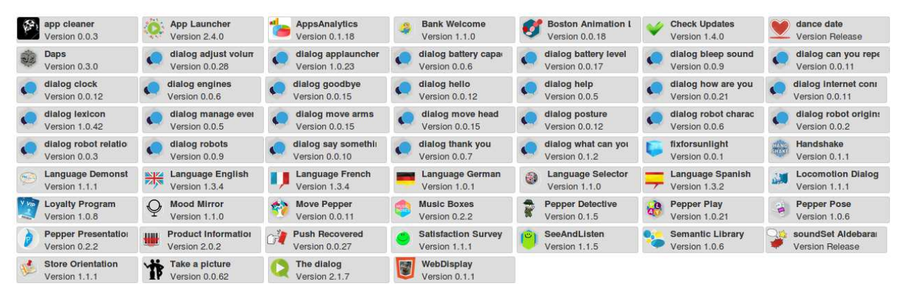
Figure 1: List of applications provided

The purpose of this task is to introduce the robot platform and the robot operating system in order to facilitate partners' experimentation. All the partners who were supposed to receive the Pepper robot have received the latest version of the robot (version 1.7 also called 1.6B). Concerning the operating system, ALD has provided a modular architecture for the software based on the existing operating system environment of its robots and the requirements of the partners by delivering packages based on ROS (Robot Operating System), instructions to install them and a tutorial to explain how to use them, either on a remote computer or embedded on the robot. ALD also granted access to applications to demonstrate and give example of the capability of the robot.